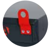
CRANE LIFTING EYES